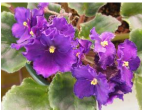
Kindred Spirit (M Taylor) Single purple frilled sticktite pansy. Variegated dark green and cream.