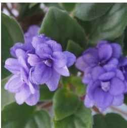
Rob's Wagga Wagga (R. Robinson) Double dark blue sticktite/variable white marking. Medium-dark green, plain, pointed, serrated. Semi miniature trailer