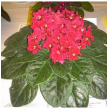
Arapahoe Semi double red large star. Light-medium green, plain, pointed. Large