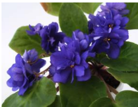
Pam's Pride (K. & P. Kennedy) Double medium blue star. Light green, plain, heart-shaped. Standard