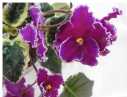
Flower Drum (M Taylor) Single Fuchsia frilled pansy/green white edge. Variegated medium green and white, quilted.