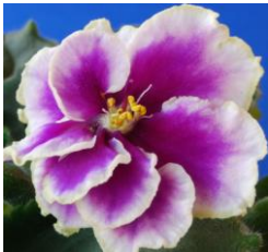
Shimmering Sunshine (B. Donsworth) Semidouble fuchsia star/white-green frilled edge. Medium green, quilted. Standard (ANZ 478, 1998)