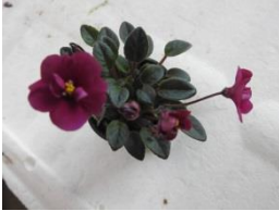
Dancin' Trail (S. Sorano) Double red star. Dark green, pointed, glossy/red back. Semiminature trailer