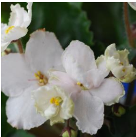
Starlight Express (M. Taylor) Single-semidouble white to blush-pink large star. Dark green, glossy, serrated. Standard (ANZ 586, 2004)