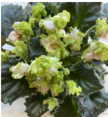
Bishop SD rose pansy/green ruffled edge. Light green, heart-shaped, quilted, wavy leaf