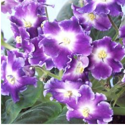
Ness' Jesse (D. Ness) Semidouble lavender wavy star/white eye, darker lavender ring. Dark green, quilted. Small standard