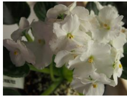
Ness' Viking Frost Semi double white pansy. Medium green, quilted, scalloped leaf.