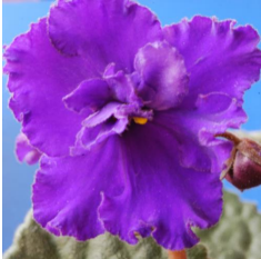
Corroboree (M. Taylor) Single dark purple frilled pansy. Dark green, pointed, scalloped. Large