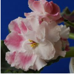
Girl Talk (M. Taylor) Semi double-double pink and white star. Dark green, scalloped. Standard