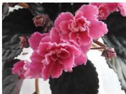
Emrose (M Taylor) Semi double to double large rich pink star, white edge. Dark quilted foliage.