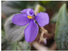
Blue Tail fly (Dates) Medium blue wasp. Bustle-back.