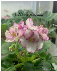
AV-Zenlyanika White sticktite pansies with a ruffled edge. Rose peephole and Rose border. On the border and eye grains of crimson fantasy. Slightly ruffled medium green leaves.