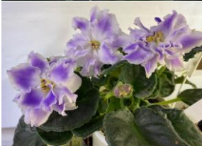
RS-Sirena S-SD large white wavy star/blue patches. Medium green, plain leaf.