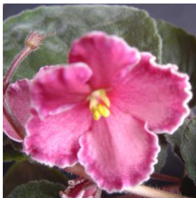
Painted Desert Single salmon-pink sticktite pansy/red-mauve top petals, dark red band, white edge. Medium green, plain, ovate. Standard.