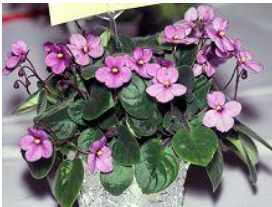
Deer Trail Single orchid. Medium green, plain, round leaf