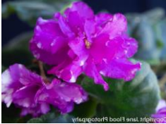
Belinda Grace Double cerise with white markings.