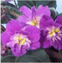
Hawaiian Pearl (S. Sorano) Semi double-double ivory star/dark lavender-rose band. Dark green. Standard