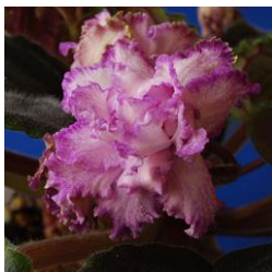
Fredette's Sweet Jenny Double white star/lavender-rose frilled edge. Dark green, plain. Standard.