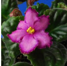
RD's Gleam (R. & D. Townsend) Semi double hot pink star/raspberry frilled edge. Medium green, plain. Standard