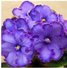
Bos Veronika Single lavender stars, with ruffled purple edging, overlapping petals. Medium green, oval, slightly scalloped edges