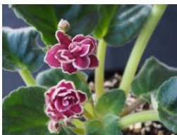
Candyman (M Taylor) Double red pansy/wide white edge. Medium Green. Standard