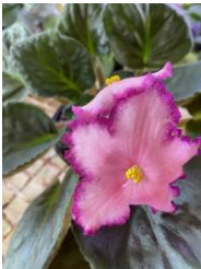
Austin's Smile Single coral-pink frilled star/darker fantasy, raspberry edge. Dark green, ovate, quilted, serrated/red back. Standard.