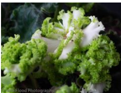
Irish Castles Double white frilled pansy/green edge on top petals, variable on lower petals. Medium-dark green, quilted.