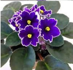
Optimara Hawaii The star shaped blooms present a striking color contrast in rich purple and bright yellow - with white trimmed edges