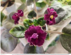
Ruby 'n' Emerald Exotic , ruby -red double blooms with fringed chartreuse-green tips to petals.