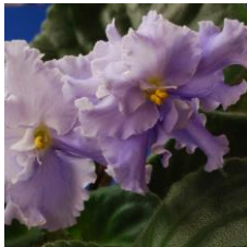
Anastasia Semi double pale blue two-tone pansy. Medium green, plain.

Payment before I pack orders. I’m like any other business, no payment, no pack! I pack leaf orders in the order I receive payment.