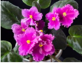
Sunset Glow (M Taylor) Single-Semidouble pink sticktite frilled star/darker rays. Dark green, quilted, serrated red back leaf.