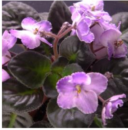
Optimara Trinidad (6602) (Holtkamp) Single violet-blue two-tone/dark eye. Medium green, plain/red back. Standard