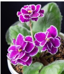
Spinner (M. Taylor) Semi double-double red-purple star/white edge. Medium green, scalloped. Standard