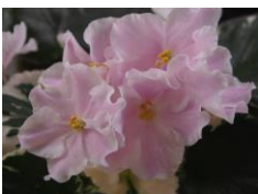
Carolina Elegant Affair. Single – Semi double white ruffled star/pink patches. Variegated medium green & white quilted wavy leaf.