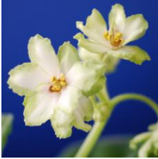
Green Lace (L. Lyon) Semi double white large star/wide green edge. Medium green. Large