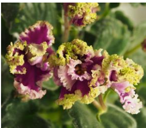
Lacy Lass Single-semi double fuchsia star/white fringed edge, green tip upper petals. Medium green wavy leaves.