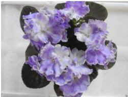
Opera's Paolo (D. Burdick) Semi double light lavender-orchid ruffled pansy/white eye, variable white-pink fantasy; thin white edge. Medium green, plain. Standard