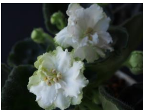
RS-Mavka S-SD white large wavy star/cream patches, green edge. Dark green, ovate, scalloped leaf.