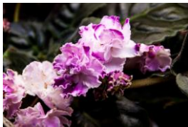
Daydream (M. Taylor) Double rose pink/white edge. Medium green. Standard.