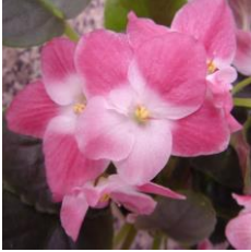
Watermelon Wine (M. Taylor) Single salmon-pink/white eye. Medium green. Standard (ANZ 593, 2006)