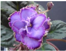
Blue Dragon (Lyndon Lyon Greenhouses/P. Sorano) Double light blue large frilled star/raspberry edge. Dark green, plain/red back. Large.