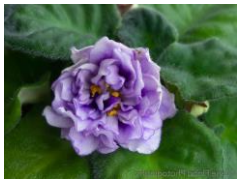
EK Black Pearl Double purple-violet star. Dark green, ovate. Standard. (Russian Variety)