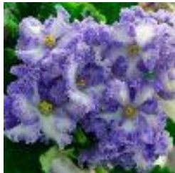
Partly Cloudy Semi-double white with blue and mottled green highly frilled edging. Medium green wavy leaf,