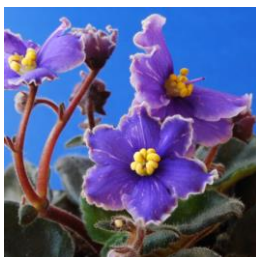
Powderworks (M. Taylor) Semi double light purple star/pink fantasy. Dark green, plain. Standard