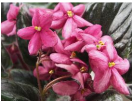
Smooch Me (K Stork) Single-semi double rose-pink pansy/variable red eye. Dark green, quilted, glossy, serrated.