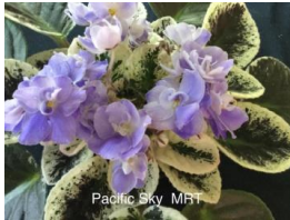
Pacific Sky Semidouble blue and white. Variegated dark green and white, quilted.