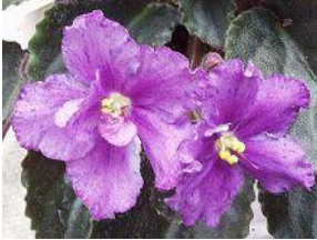
Sea Rainbow Fuchsia and Lavender fantasy star . Dark green red back leaf.