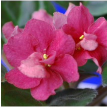
Pueblo (K. Stork) Single-semi double coral star. Dark green, plain/red back. Large