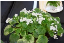
Jays' Icecastle (J White) Semi double white pansy. Crown variegation medium green and cream. Semi miniature trailer (Aust)