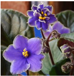
Ocean Eyes (7780) (M. Burns) Single-semidouble medium blue star/darker eye, white wavy edge, variable green. Medium-dark green, heart-shaped, quilted, glossy/red back. Large