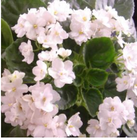
Milang Starbrite (G. Ford) Double white. Medium green, plain. Standard (ANZ 219, 1985)