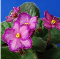
RD's Illusion (R. & D. Townsend) Semi double dark pink star/wide dark raspberry frilled edge. Medium green, plain. Standard