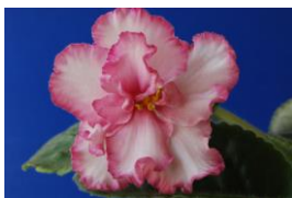
Plum Crazy Sport (M. Taylor) Semi double pink and white pansy. Medium green, quilted. Standard