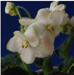
On The Fringe (M. Taylor) Single white pansy/thin green edge. Medium green, scalloped. Standard