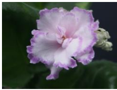
EK-Exotic Double pale pink bell/wide purple red band, light green edge. Medium green plain leaf. (Russian Variety) LIMITED LEAVES