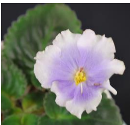
Sky Garden (M Taylor) Semidouble-double sky blue frilled star/variable white edge. Medium dark green, heart-shaped, serrated leaf.